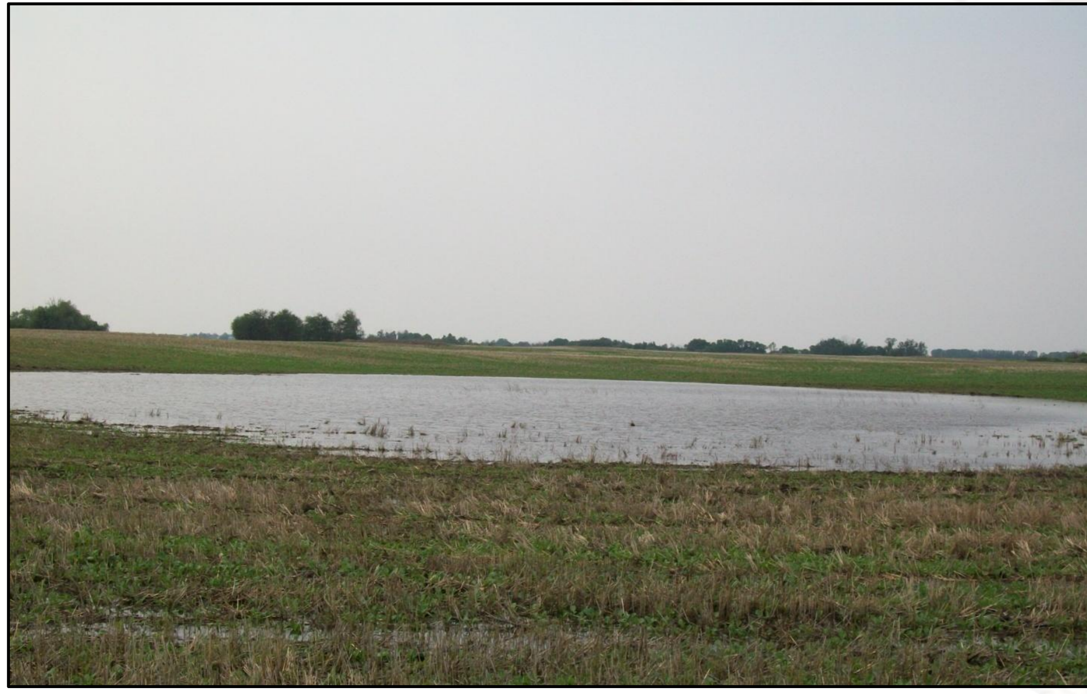
Typical wetland in the study area

□ Drainage from the proposed SMPP footprint area (approximately 80.2 ha) and the surrounding catchment area (22.2 ha) will be contained and therefore will not flow into the natural drainage course. Removal of this runoff volume from the watershed will not have a significant impact.