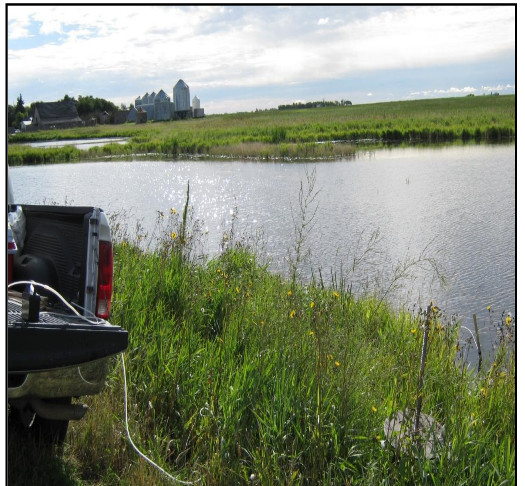
Surface water sampling at a permanent wetland