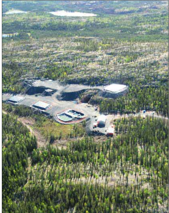
An aerial view of Fortune Minerals' NICO mine site, located 50 km north of Whati.

The review board argued that "an indefinite postponement of the (environment